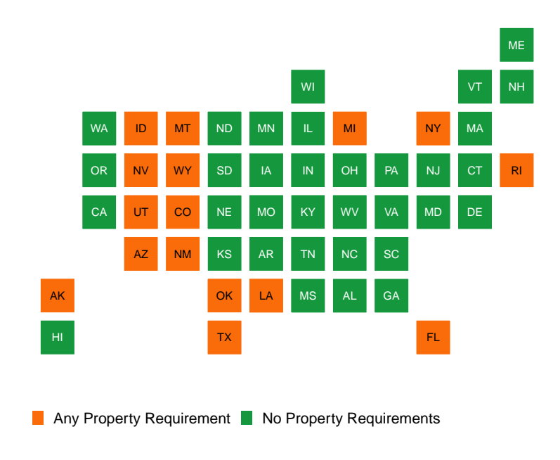
Figure 3: Property Requirements for Bond Referenda in 1968

(Nevada and Wyoming), bond referenda elections used a dual-ballot system in which property owners would vote on one ballot, and non-property owners who were otherwise qualified votes would vote on a different ballot; majorities of both sets of voters were required for the referendum to pass (other states also used a two-ballot system in some instances). In the other fourteen states only 'taxpayers or owners of taxable property" could vote one some types of bond referenda (Mumford 1971, p.17).