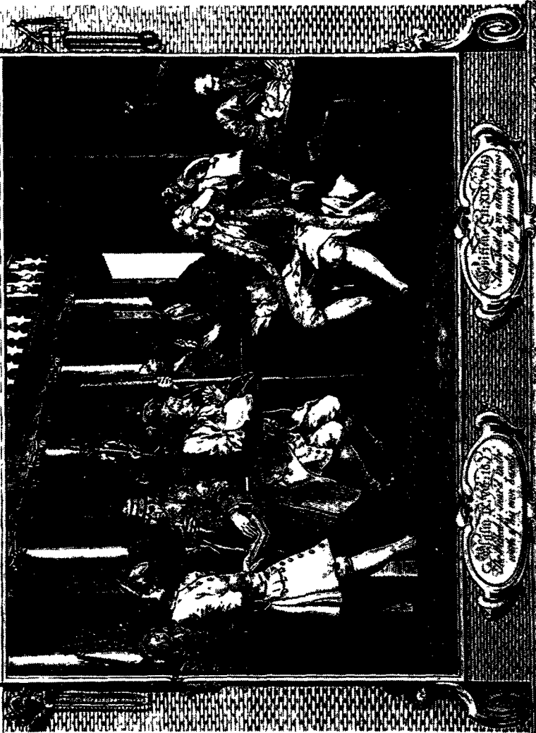
The INDUSTRIOUS PRENTICE. Alderman of London, the Idle one brought before him & Impraced by his Accomplice.