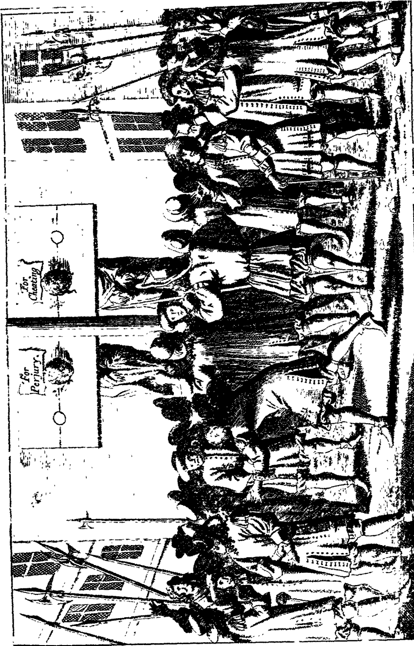
The Punishment of the Pillory for Perjury, Cheating, and other Misdemeanors.