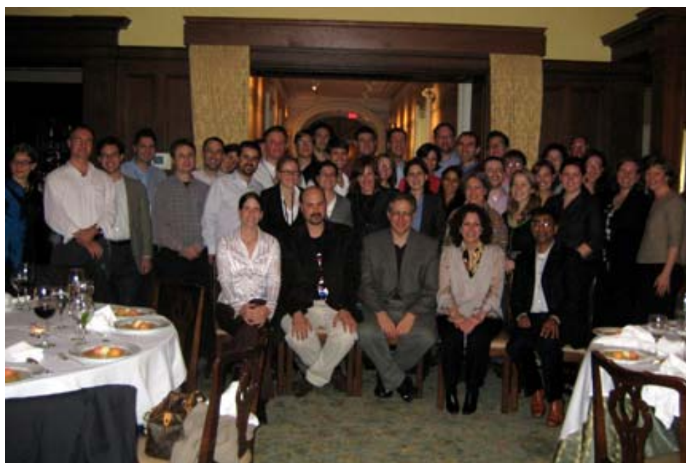
Celebratory Dinner at Union League