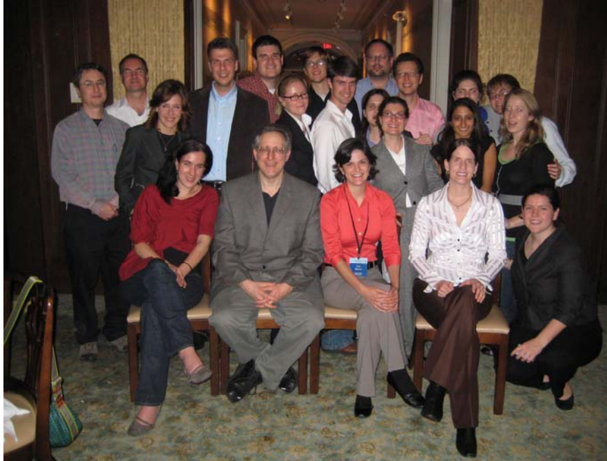
2008-2009 Information Society Project Fellows