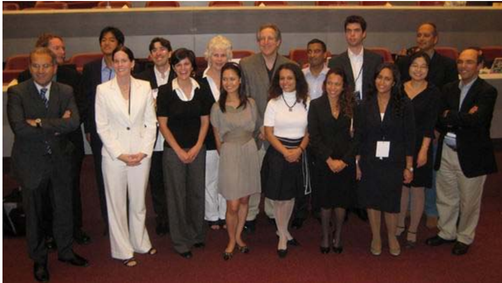
Yale ISP International Research Partners from Egypt, South Africa, China, India, and Brazil