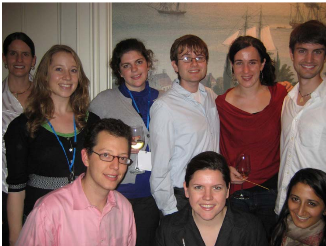
Some ISP Student Fellows at the Reunion Dinner