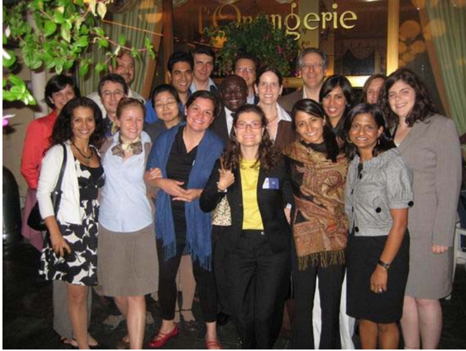
Members of the Yale ISP in Geneva, Switzerland

September 8-10, 2008 in Geneva, Switzerland