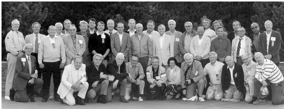
Conference of Chief Justices in 1986