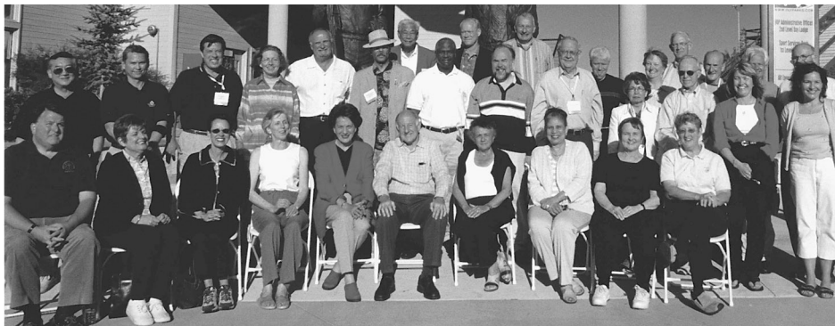
Conference of Chief Justices in 1996