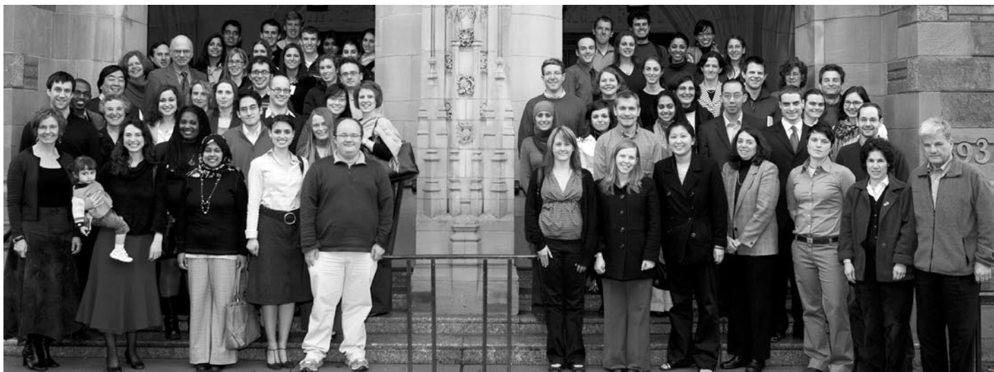
Liman Fellows gather at Yale Law School for the Tenth Colloquium.

Newark Mayor Cory Booker, Yale Law School '97, Gives Keynote Address