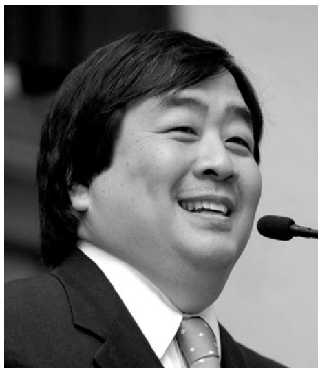
Dean Harold Hongju Koh