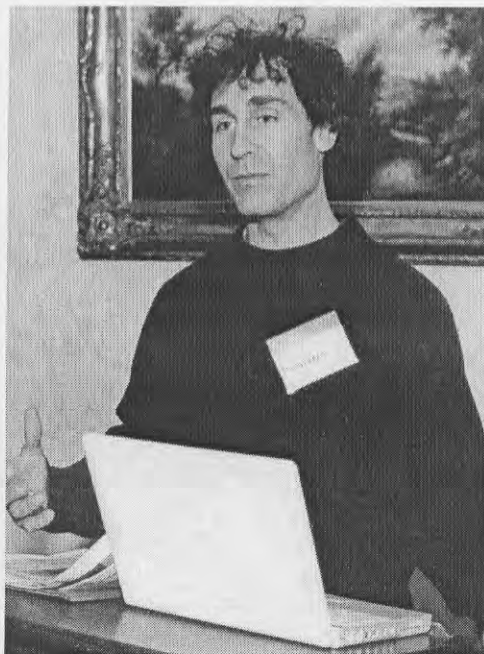
Filmmaker Doug Liman