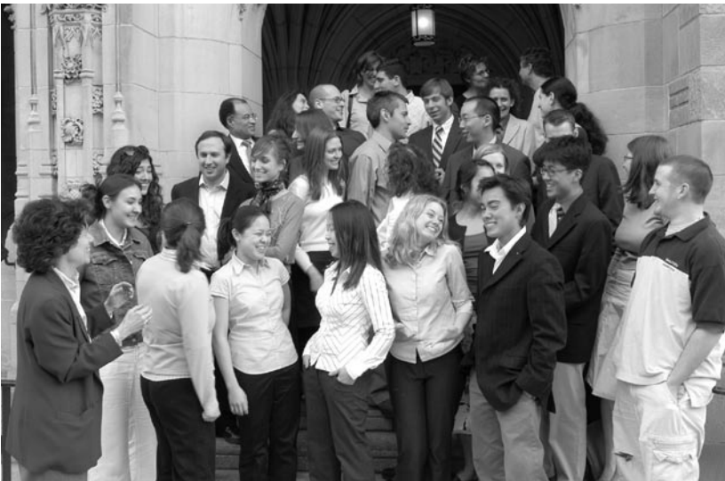
Members of the Liman Program community gather at this spring's conference.