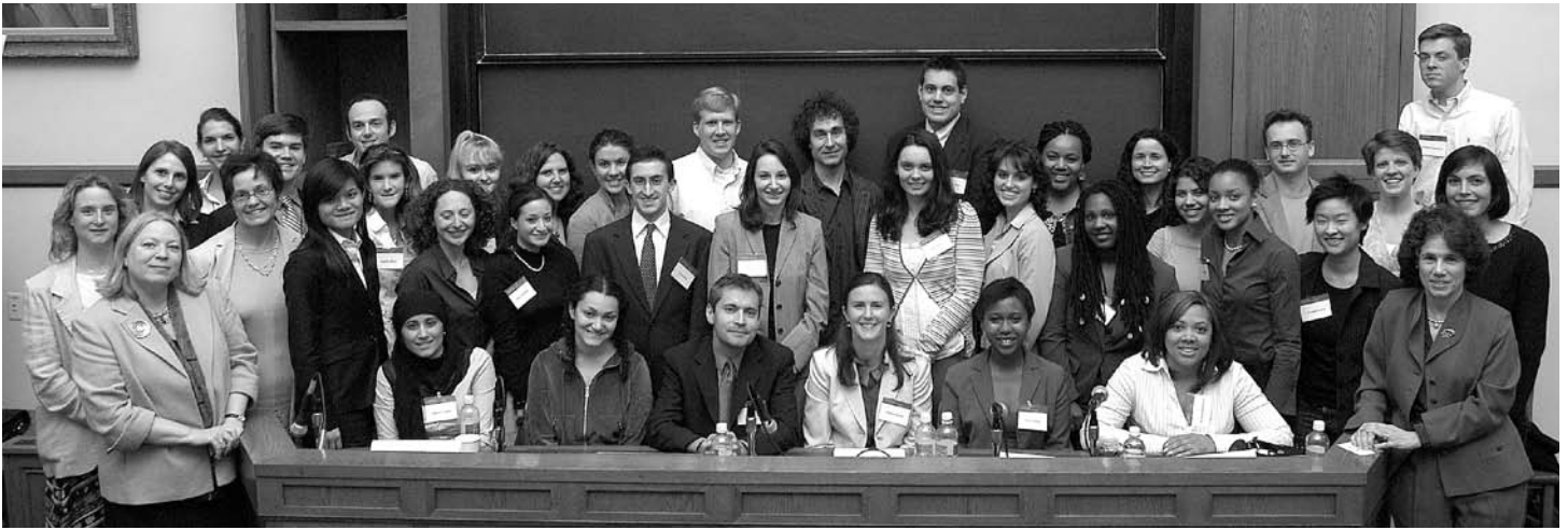
Members of the Liman Network gathered at the close of the Colloquium. Included in the photo are current Liman Fellows, current and former Summer Fellows, advisors from schools participating in Summer Fellowships, and Doug Liman (in the back, center), who is Arthur Liman's son and a filmmaker.