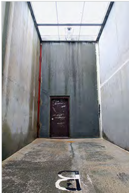
An exercise yard in the Pelican Bay SHU.

Picture yourself in a car heading north from San Francisco. Six hours after you leave that spotless city—after you pass the blissful yuppie towns of California wine country, and then the redwoods and hippie outposts of Mendocino and Humboldt, and then two hours of vacant, foggy coast north of Eureka—you arrive in Crescent City, 13 miles from the Oregon border. Physically, culturally, Pelican Bay is as remote from the rest of California as the state's borders permit. Plaques in the motels warn visitors of the danger of tsunamis. Topographically speaking, the place is a fortress of isolation: Alaska-like, rocky and vertical and misty. It is an amazing place to put a prison.