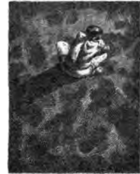
ILLUSTRATION BY BRAD HOLLAND

P.O.s have reported that the simple experience of isolation is as much of an ordeal as any physical abuse they have suffered.