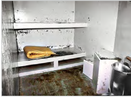
A cell in the Pelican Bay SHU.