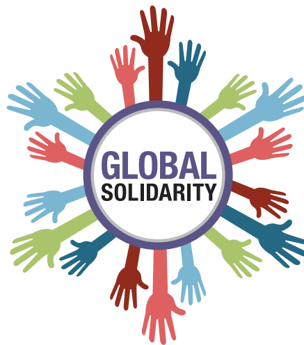
Fig. 1. By sharing influenza viruses with human pandemic potential and building financial and research partnerships, countries can unite to widen access to vaccines.

Although it has the potential to be transformative, the PIP Framework leaves fundamental gaps in health security and in equity.