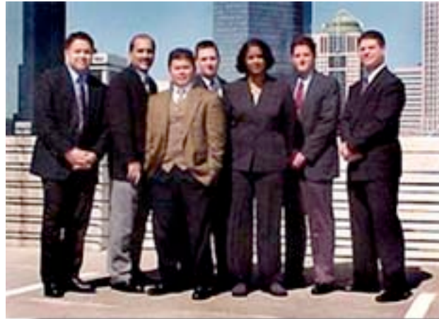
The International Relations Unit

In the fall of 2000, Charlotte-Mecklenburg Police Department , in its efforts to enhance relations with the International community and to address their unique needs, created a new Unit. The Unit would not only address the challenges of communication but also assist in understanding cultural differences. In December of 2000, the International Relations Unit (IRU) was formed.