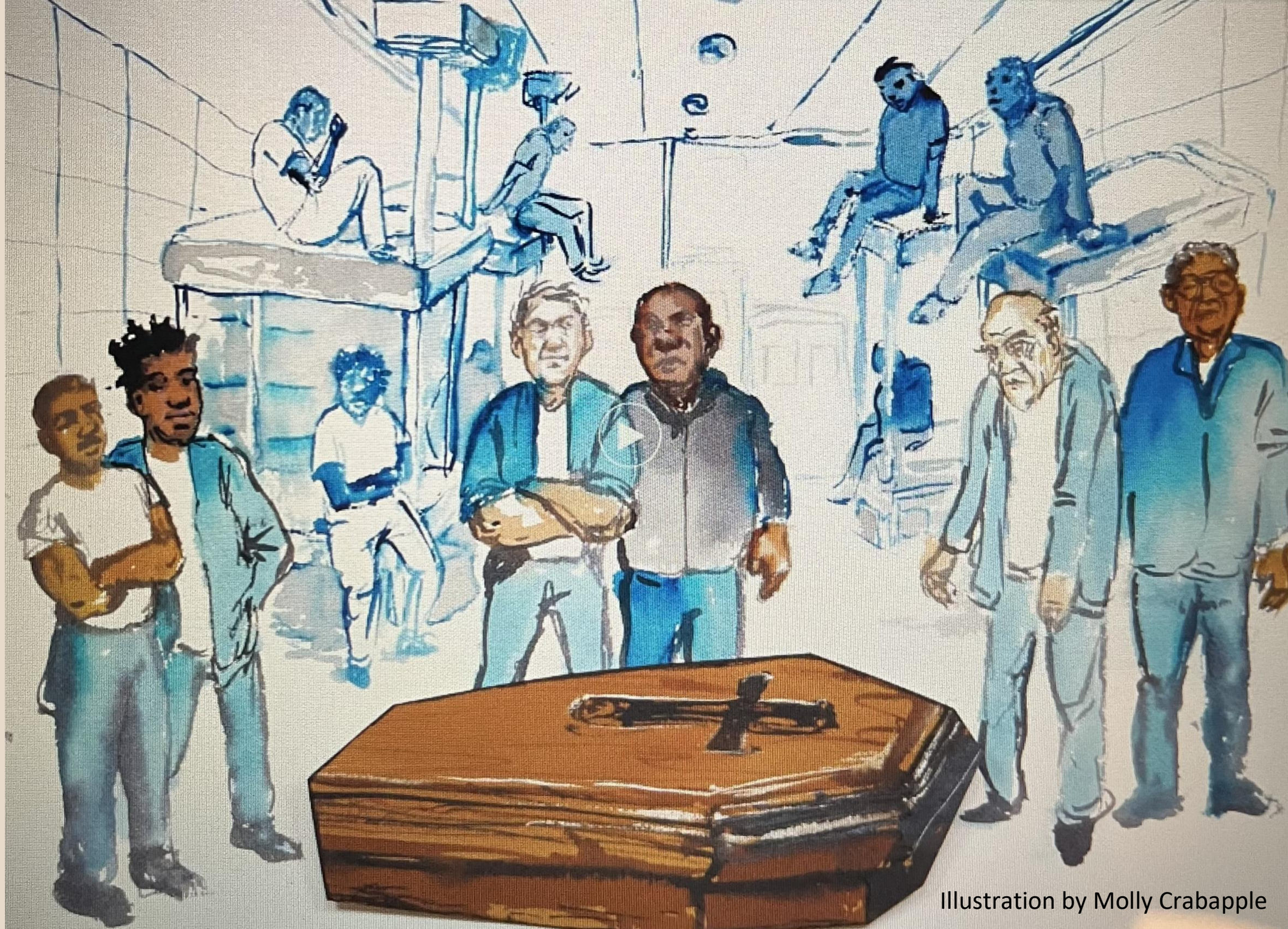
Illustration by Molly Crabapple

Co-sponsors: Freedom Reads, Liman Center, Afro-American Cultural Center