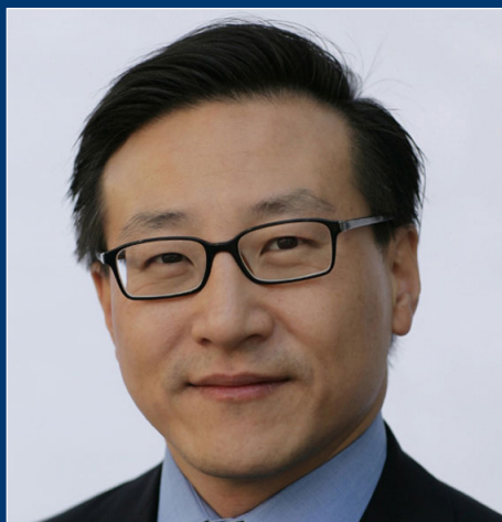
Joseph C. Tsai Executive Vice Chairman, Alibaba Group